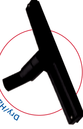
Dry/Hard Floor Tool

This attachment is made for use on tiles, polished or parquet floors.